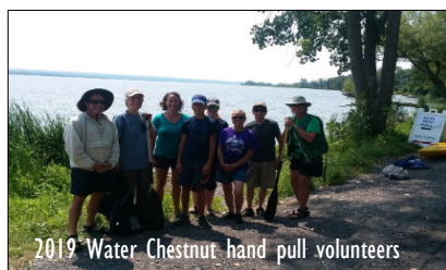
2019 Water Chestnut hand pull volunteers

In addition to mechanical harvesting, the SWCD in partnership with the FL PRISM http://fingerlakesinvasives.org/ conducted a Water Chestnut hand pull event around the Canoga Marsh area and Northwestern shoreline of Cayuga Lake. This event produced 33 lbs of Water Chestnut. Reproduction occurs from fragmentation of the rosettes and thorny nutlets which mature in late summer, making early removal key.