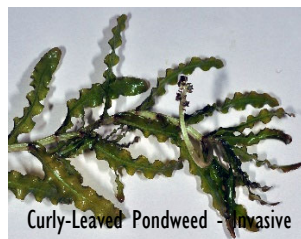
Curly-Leaved Pondweed - Invasive