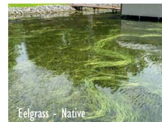
Eelgrass - Native

In addition to mechanical harvesting, the SWCD in partnership with the FL PRISM http://fingerlakesinvasives.org/ conducted a Water Chestnut hand pull event around the Canoga Marsh area and Northwestern shoreline of Cayuga Lake. This event produced 33 lbs of Water Chestnut. Reproduction occurs from fragmentation of the rosettes and thorny nutlets which mature in late summer, making early removal key.