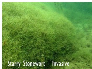
Starry Stonewort - Invasive

The summer operation focusses on removing invasive aquatic weeds as well as clearing navigational channels out to deeper water. Harvested weeds are collected and transported to an off-site location and allowed to compost. The majority of weeds harvested in 2019 are pictured below.