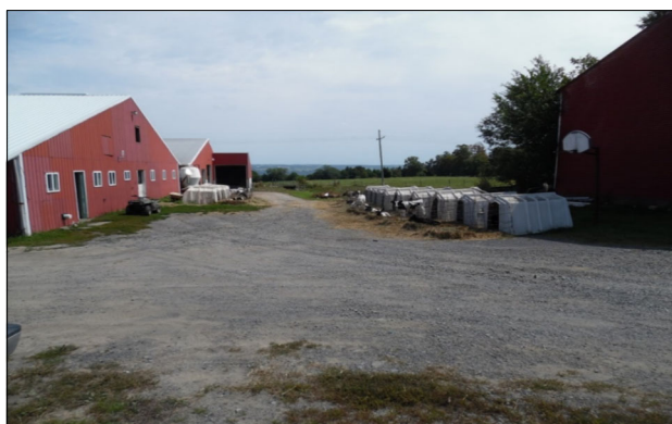
Calf Hutch Area Before

with a Vegetated Treatment Area (VTA) that will filter out any potential nutrients from entering the nearby stream. Roof gutters and underground outlets were installed to divert clean roof water around the new calf hutch pad.