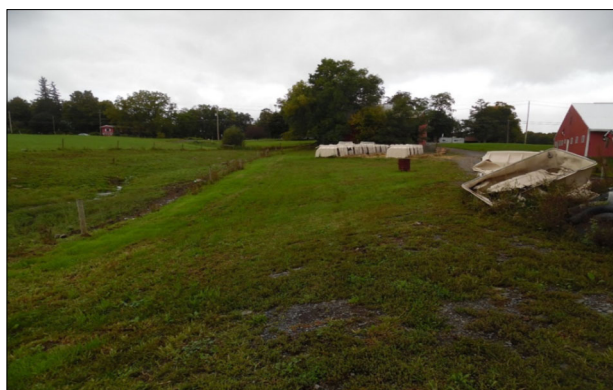
New Calf Hutch Area and VTA