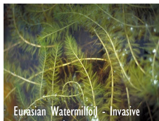
Eurasian Watermilfoil - Invasive