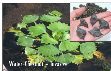
Water Chestnut - Invasive